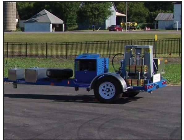
FWD testing to determine structural capacity of an industrial parking lot

The FWD applies a load impulse to the roadway surface by a specially designed loading system which simulates the dynamic short term loading of a moving wheel load. The deflection basin response of the pavement is measured with a set of 9 precision geophones at varying distances from the loading plate. AET evaluates the deflection response of the pavement and can calculate the pavement strength as well as the "in-situ" resilient E-moduli of each layer in a pavement structure. The resilient E-moduli of each layer of material are important factors for new pavement design as well as estimating the performance of rehabilitation options.